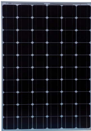
High Efficiency Solar Modules Ideal for Any Application